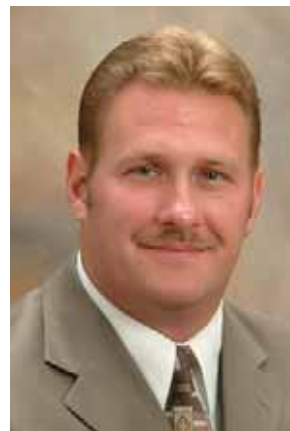
Mayor Tony Krasienko City of Lorain (Lorain County)