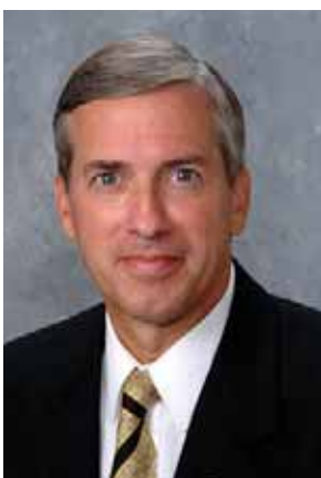
Mayor Thomas O'Grady North Olmsted (Cuyahoga County)