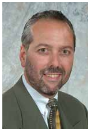
Commissioner Charles Keiper II Portage County